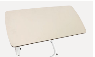
Table top is made of phenolic resin laminate with PVC cover.