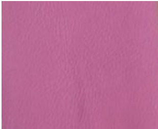
Light rose red 2892-15