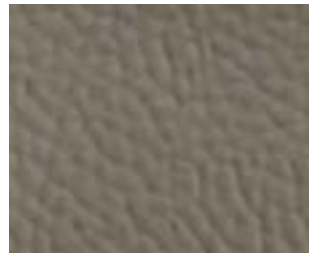
Light grey 5509-14