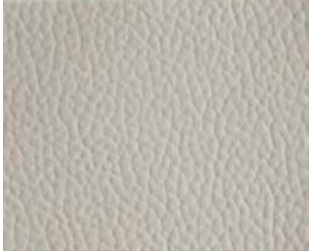
Off white 5509-1