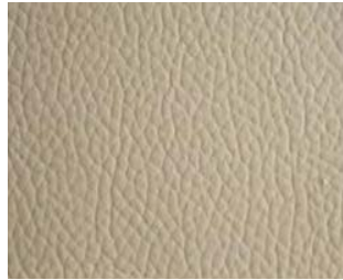
Off white 5509-2