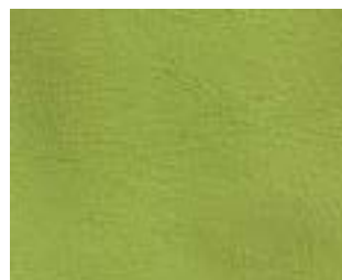
Light green 2210-88