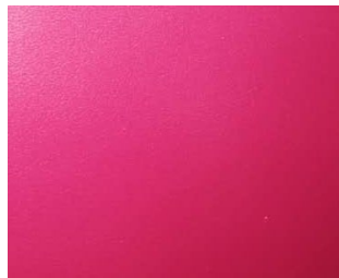
Rose red 2201-30